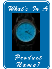
Indigo Night Light Watch

CÔte D'Azur (French for Coast of Blue ): Blue Coast